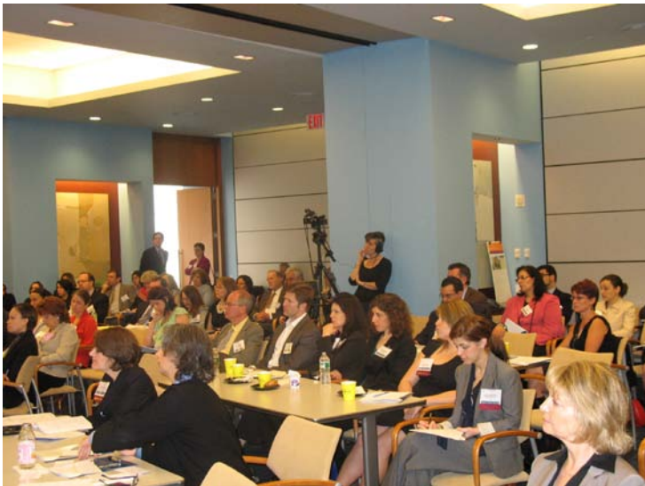
Audience at BBB Corporate Responsibility Forum May, 2010