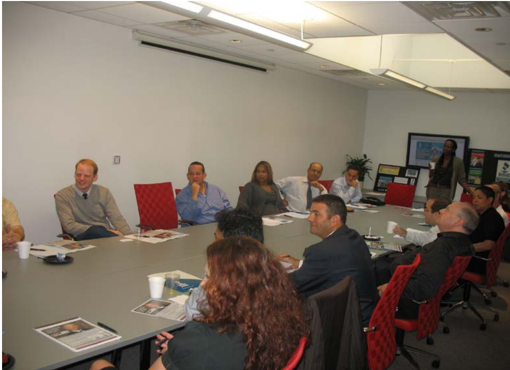
Accredited Businesses Leaders attending a Networking Meeting in the BBB Offices

BBB Accreditation works to inspire confidence among the public, government agencies, the press, and within the business community by proving a business' commitment to the standards upon which the BBB is founded. Alignment with the BBB allows businesses to strengthen their reputation.