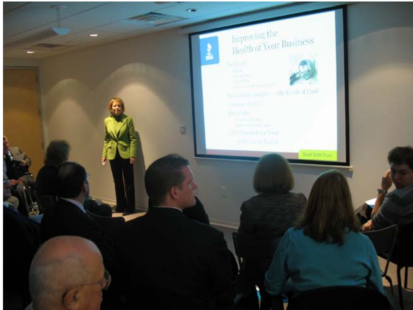
Leaders from Accredited Businesses attending a Networking Meeting in the BBB Offices

The Business Development and Relationships department regularly conducts special networking breakfast meetings, which cater to small groups in each region. In 2010, the New York City office held four such meetings; the Long Island and Mid-Hudson offices each held such a meeting. These meetings provide the opportunity for Accredited Business leaders to meet, network, and learn about how best to leverage their BBB Accreditation.